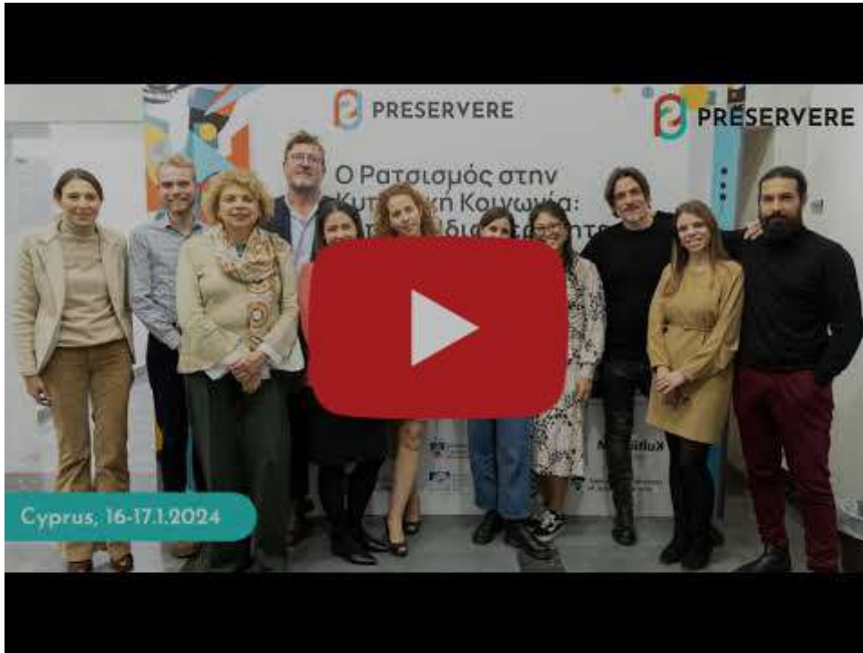
Preservere Final Conference - Cyprus, 16-17.1.2024